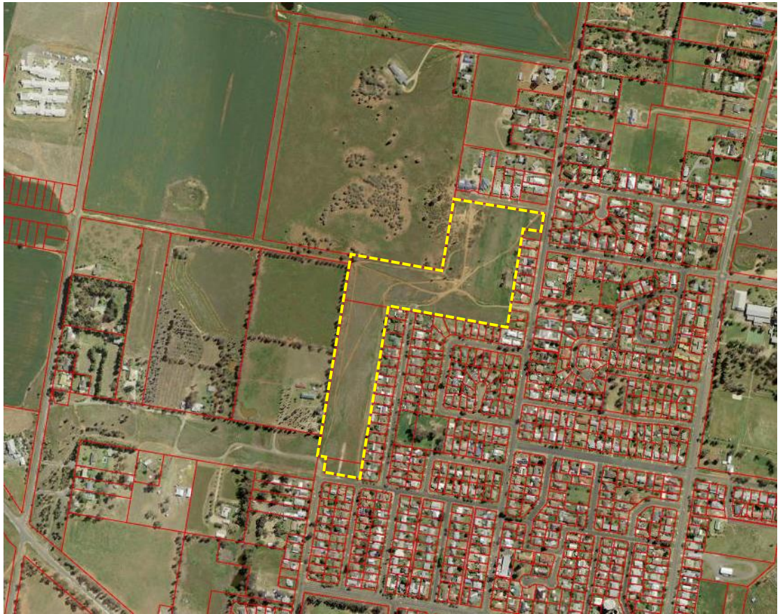
Figure 02: Eplanning portal Bushfire Prone Land Map